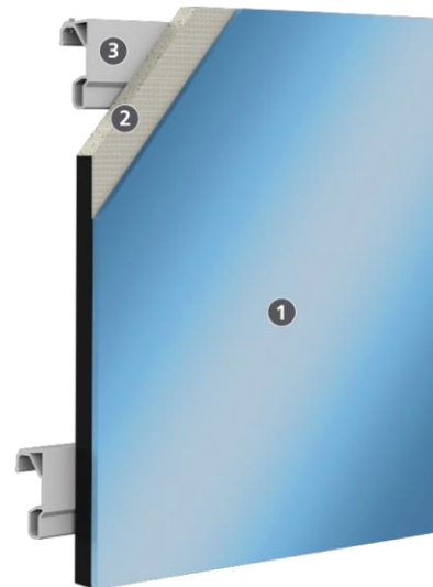
Sto Ventec Glass Panel Assembly: Sto opaque glass (1) fully bonded to 20mm Sto Carrier Board A+ (2) with StoVentec® Panel Profile (3)